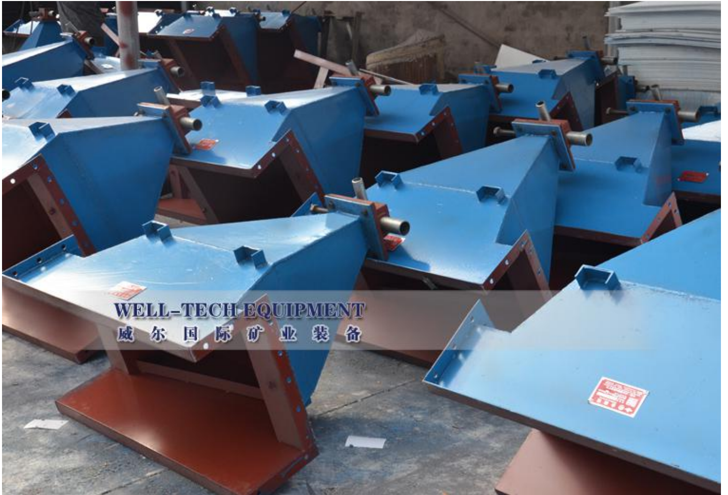
mud separate machine