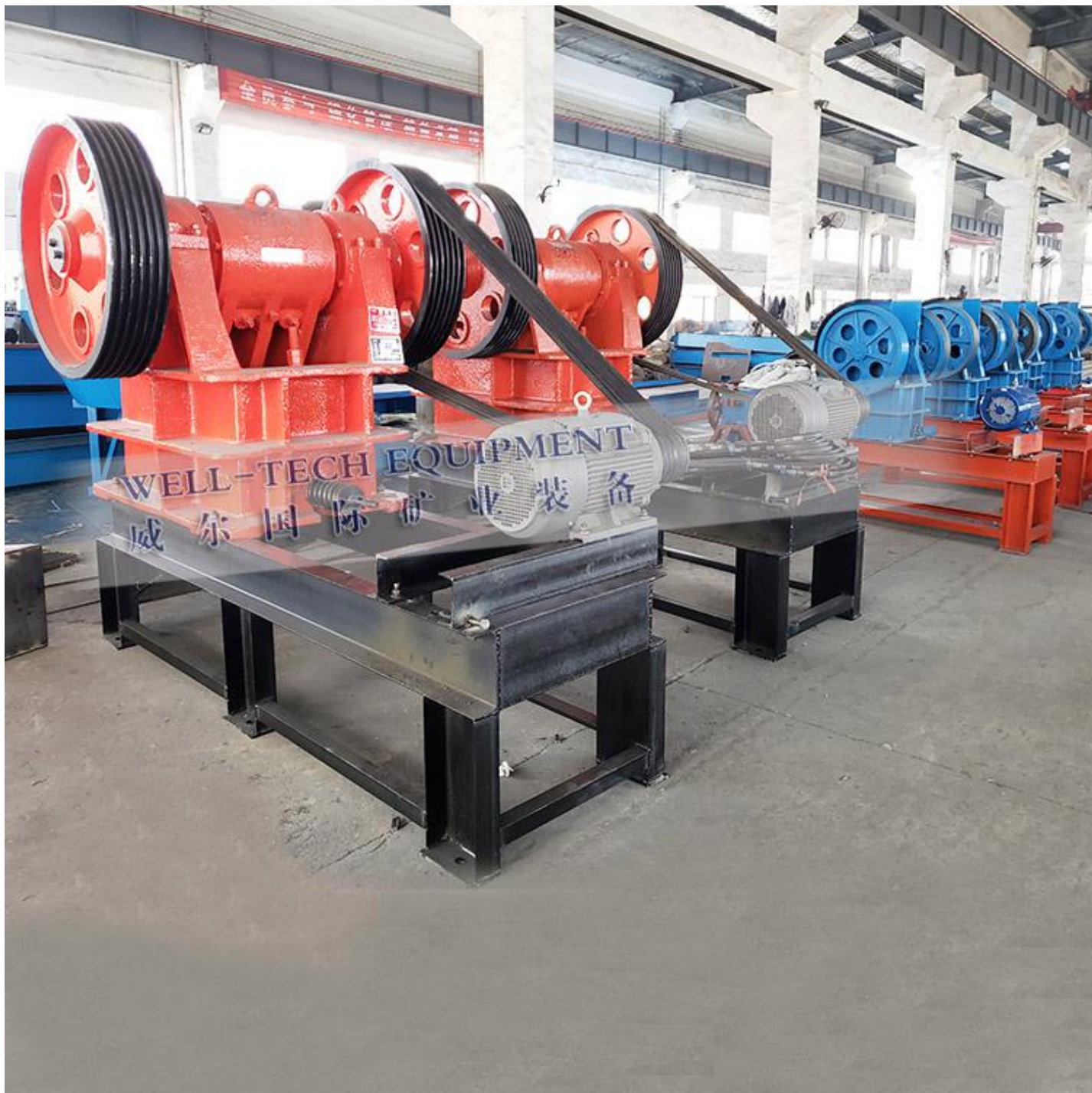
rock jaw crusher