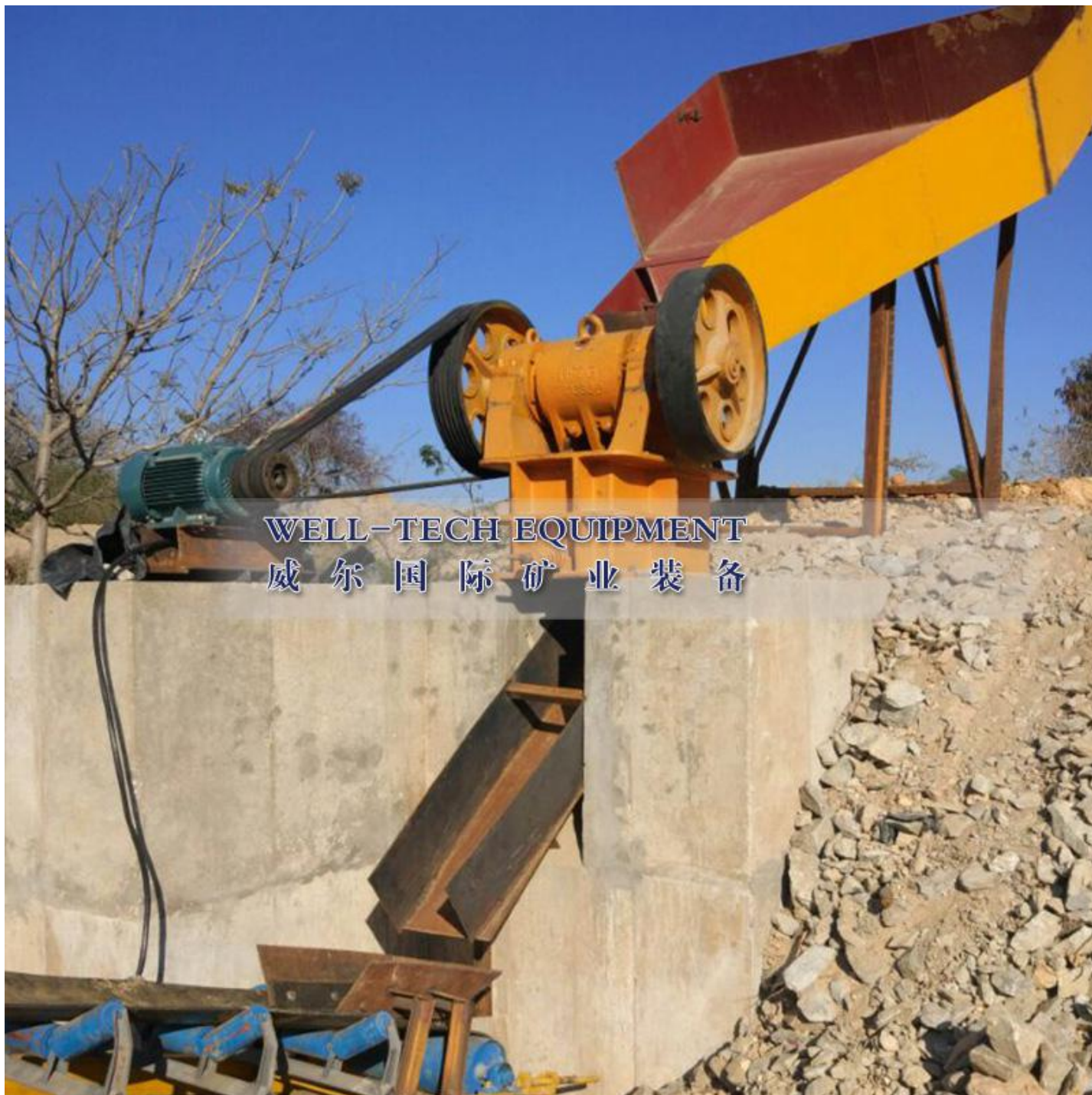
gold ore crusher jaw crusher