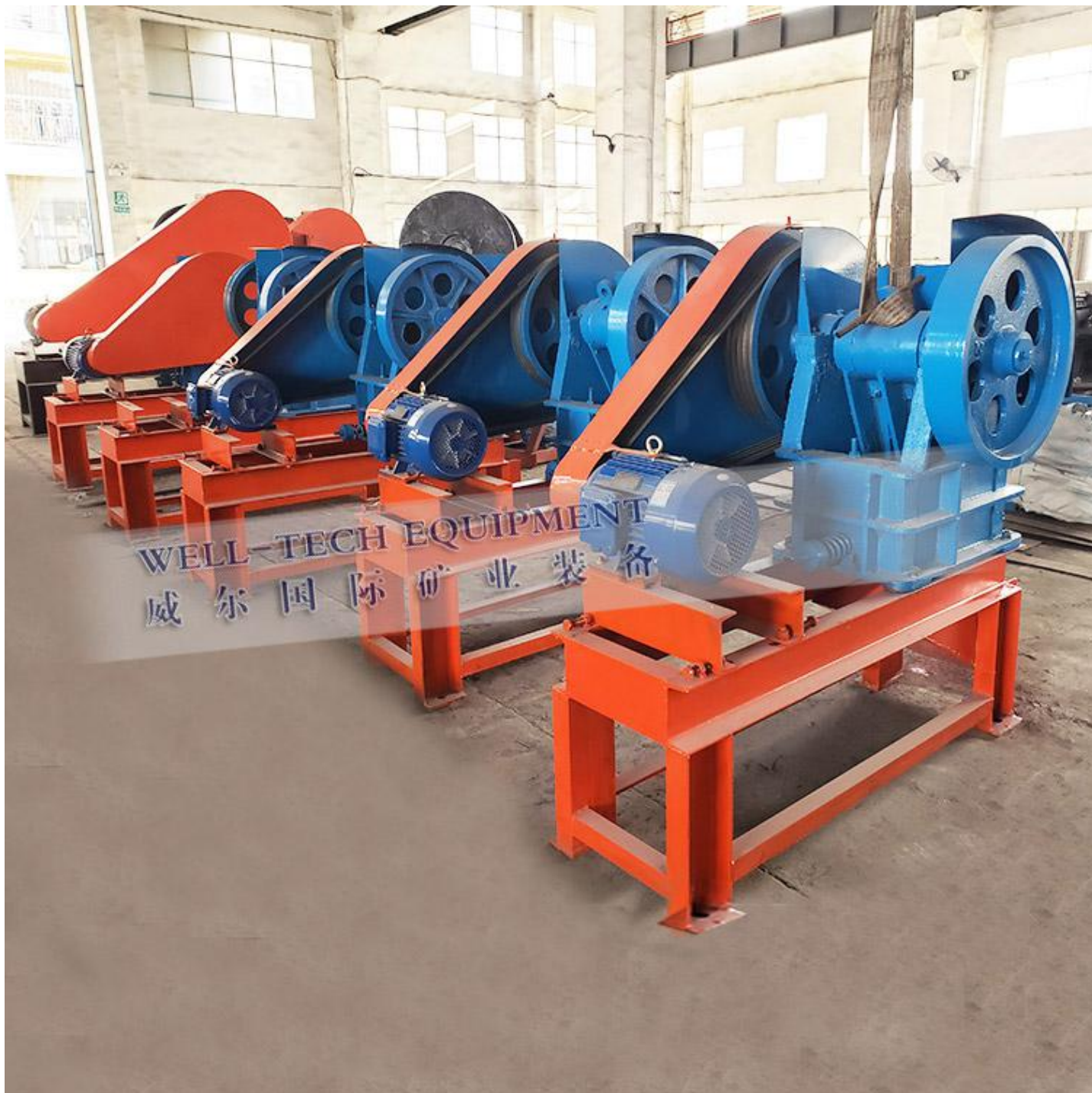
mini jaw crusher