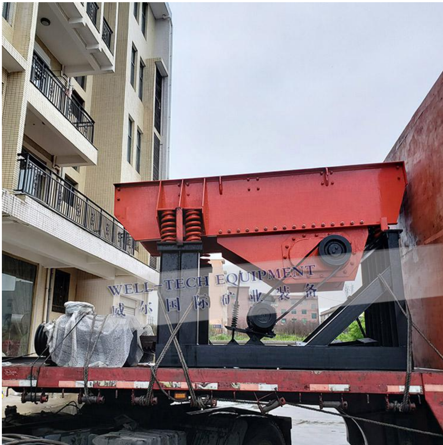
Stone vibrating feeder